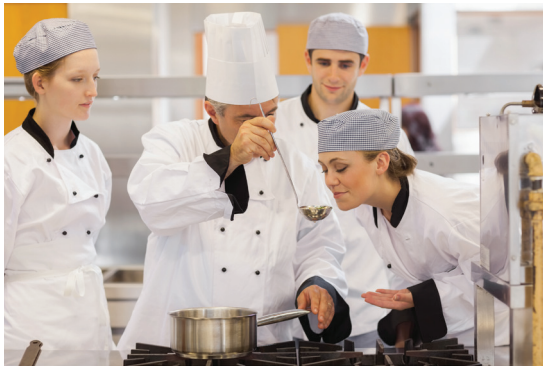
Fundamental Foodservice Skills

Lively Technical College partners with Vocational Rehabilitation to address employment needs such as career planning, internships/work based learning opportunities (paid and unpaid), completing resumes, interview skills, and job placement (with support).