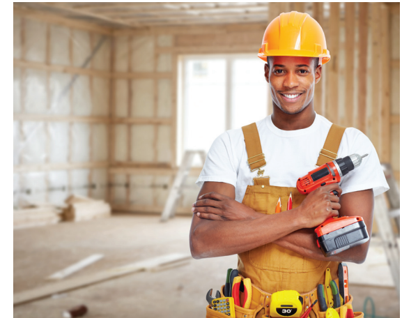
Building Trades & Construction Design Technology

Part-time and full-time hours are available for the above programs.