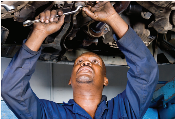
Automotive Service Technology

*All eligible students must have independent living skills.